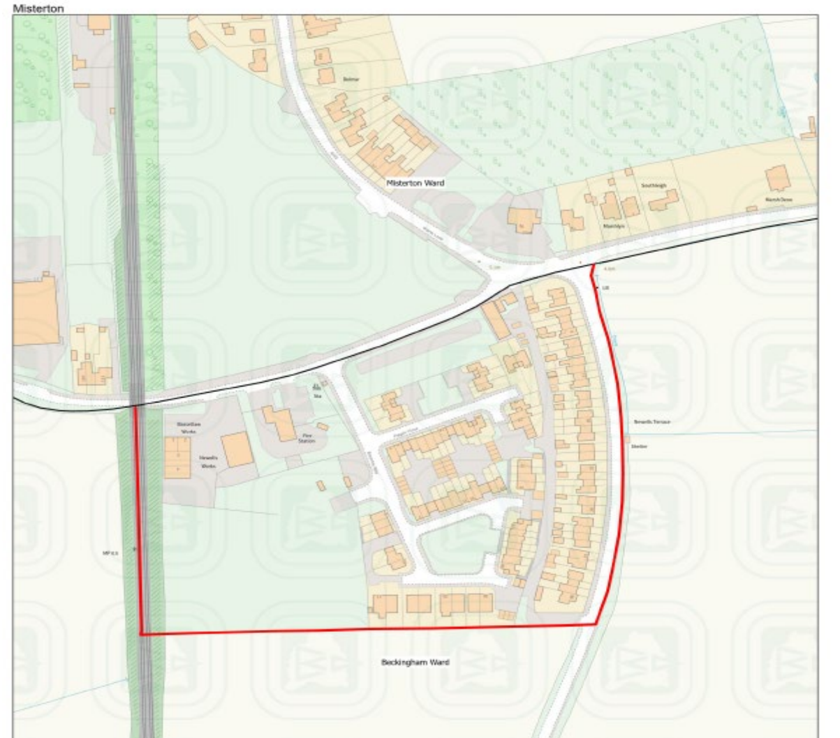
Map 2: Revised boundary between Misterton and Beckingham wards

linkages. The Neighbourhood Plan notes the clear distinction in this area as Idle Lowlands - in common with Misterton.